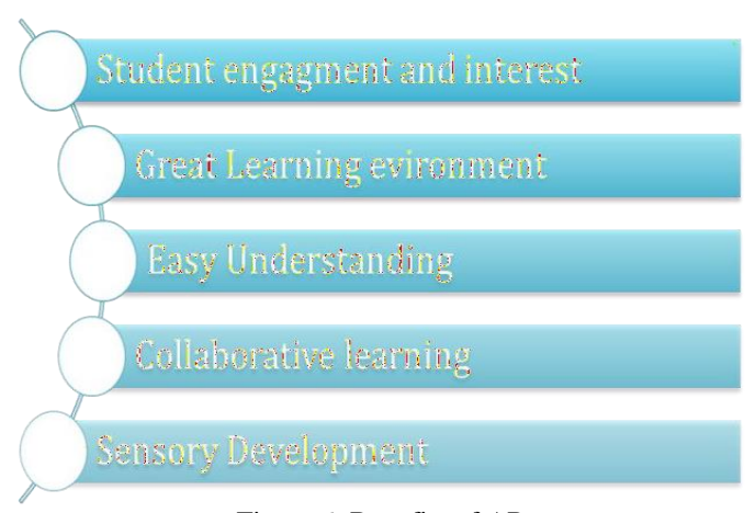
Figure 6: Benefits of AR

Augmented reality is widely used in educational fields. It is used to display 3D images, making learning easier and more exciting for students. Students can use AR to see and manipulate 3D geometric forms, in healthcare education. AR also provides an effective and interesting way of teaching. The teachers can use AR devices to teach more efficiently. The AR devices can be used to teach graphically and interactively which makes the teaching process more effective and exciting. The students may get attracted and interested in studying with the new technology which makes teaching interactive. This may also inspire students' minds and help the students explore their interests.