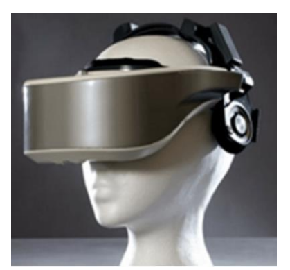
Figure 3: HMD[3]

• Handheld Displays: Handheld displays are small devices that the user can hold in their hands and use anywhere as shown in Fig. 4. They include the technologies like portable flat screen monitors or mobile phones. These are the most widespread devices.