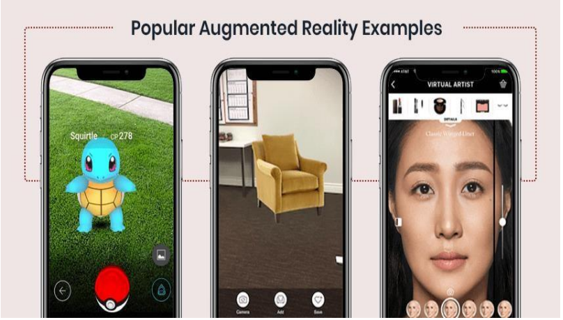
Figure 2: Examples of Augmented reality[2]